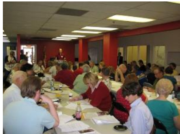
Precinct Captains Training meeting at CCGOP Office, Sat, June 14. Over 70 volunteers attended...3x expected. Great turnout and service!